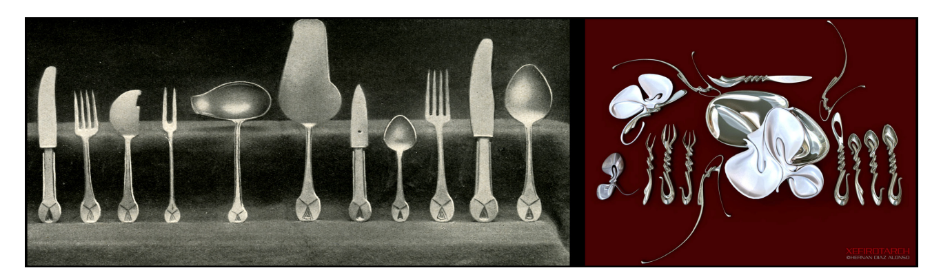
Figure 1. Left: Henry van de Velde - Cutlery set

Through these interpretations of the relation between rhythm and ornament, we are assisting to the renaissance of an aesthetic based both on the mimicry of nature and the ability to put together a new spatiality, where Art and Craft are mediated by Software parameters, where the human hand has been replaced by a digital extension on a new range of performances, dictated not by the X and Y space, but by a field where the eye acts as if it were a hand, not as a receptive but as an active organ, and what is at hand is always nearby and close, without any sense of depth or perspective, and without background or horizon. Such is the Nouveau Pulsation.